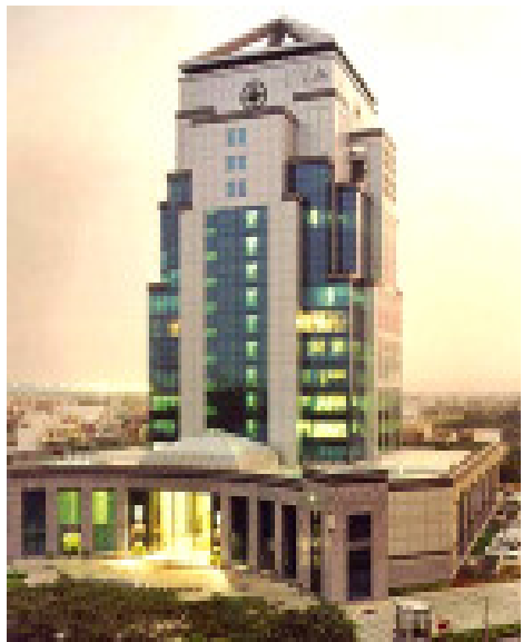
Complex designed by Hafeez Contractor